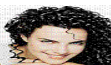
b) Ana Paula Arósio