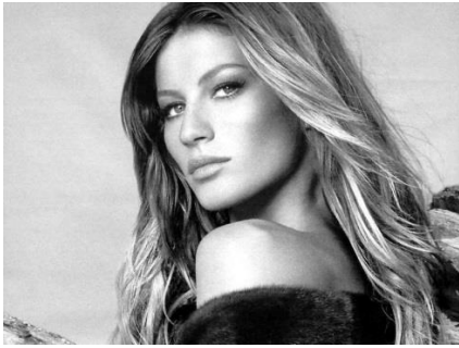
She is Gisele Bündchen

2. Now! Write about the following picture: