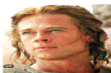
c) Brad Pitt