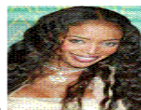
d) Naomi Campbell